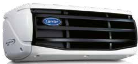
Xarios 500 / 600 / 600MT

The units' condensers and evaporator skins are fully recyclable.