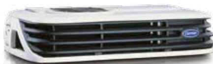
Xarios 300 / 350 / 350MT