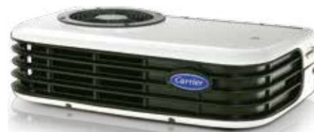
Xarios 150 / 200